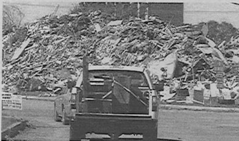
Look carefully! Six-foot-tall-man stands just to the right of the vehicle, photographing this pile of debris.

New Orleans Police Department Swat Team. There are 57 members of this squad who will thus be appropriately attired with the success of this drive. Each shirt will be delivered with a card, which will contain the name(s) of the donor(s). A card, indicating the name of the officer who received the shirt, will be sent to you.