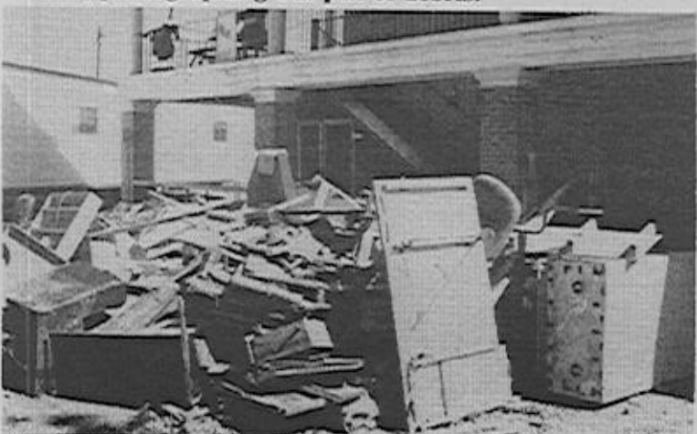
The SWAT Team Headquarters and Armory...what's left!